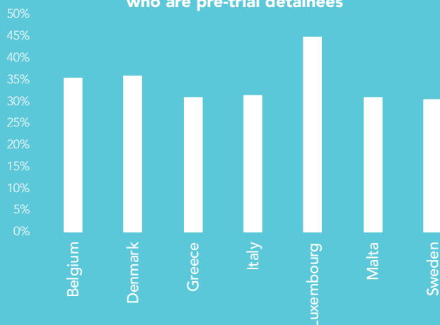
Percentage of prison population who are pre-trial detainees

“The EU is facing a long-standing crisis in prison overcrowding. The excessive use of pre-trial detention (which is supposed to be a measure of last resort) is fuelling this. The decision to order pre-trial detention carries grave and wide-ranging consequences for people who have not been convicted of any offence. But, to date, there is still no proposal for EU legislation on pre-trial detention.”