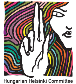
Hungarian Helsinki Committee